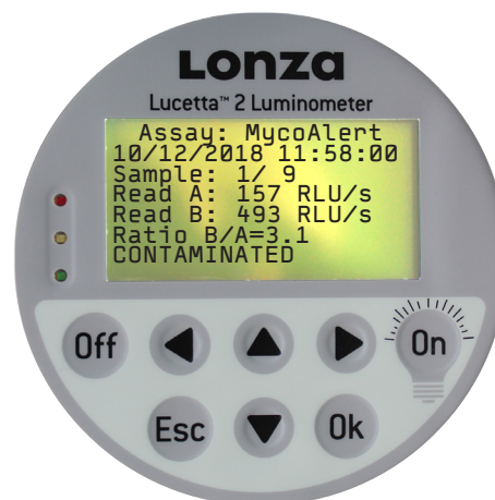
Figure 8: Example of a logged measurement

Use arrow button down ▼ to view all measurements.