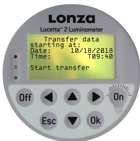
Figure 9: Example of transfer result screen