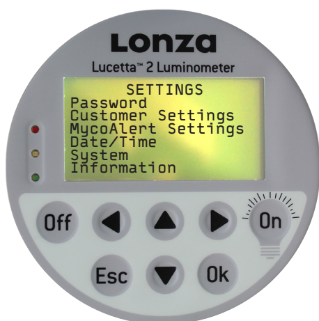
Figure 10: Submenu SETTINGS

Via the submenu SETTINGS (Figure 10) the Lucetta™ 2 Luminometer allows the setting of a user password, creation of customized protocols in Single Read mode and date and time setting options. Display settings such as brightness and contrast can also be optimized here. Instrument settings for MycoAlert measurements are password-protected and can only be accessed by Lonza service personnel. Software version and serial number of the luminometer can also be reviewed in the submenu.