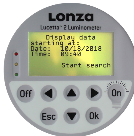
Figure 7: Example of time and date selection to view measurements

To change the date displayed, use arrow button ▲ to select DATE and press OK. Use arrow buttons ►◀ to select day, month or year. Depending on the selected country for the date format (for more details see section 6.0), the format is MM/DD/YYYY (USA) or DD.MM.YYYY (Europe). The flashing cursor indicates the number to be adjusted (Figure 7). To change the time displayed, select TIME to change hours and minutes as described for changing the date.