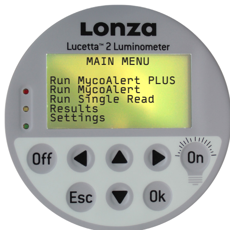
Figure 4. Main menu of the Lucetta™ 2 Luminometer.

On the front face of the Lucetta™ 2 Luminometer is an LCD display showing the menus, the measurement parameters, and the measurement results. To open a submenu from the main menu (Figure 4) move the gray select bar up and down by using the two arrow buttons ▲▼. Once at the desired position, press OK to activate that choice.