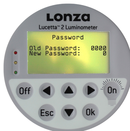
Figure 11: Display for setting a password