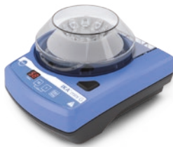
mini G Centrifuge Ident. No. 0003958000

If required, the following IKA devices are available for your lab to enhance operations using your IKA G-L centrifuge: