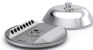
G-L PCR 0.2 mm Strip Set Accessory G-L Ident. No. 0030001334