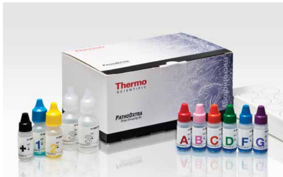
PathoDxtra Strep Grouping Kit Product code: DR0700M

Pack variants available to suit your testing needs