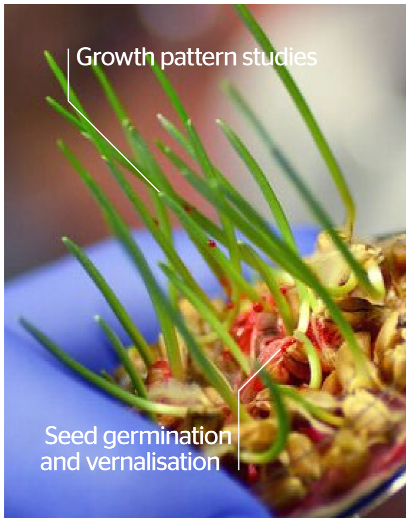
Growth pattern studies