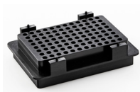
59-2005 Plate Support Adapter, Individual Access, Low Profile