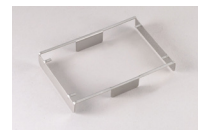
59-2009 Sealing Frame