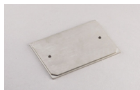
59-2001 Plate Support Adapter, Standard