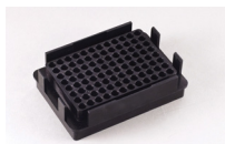
59-2003 Plate Support Adapter, PCR 96