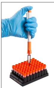
Automated Storage Systems