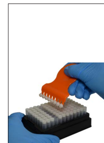
Sample Storage, Lab Services & Transport