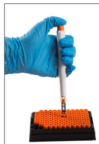
Cryopreservation & Cold Chain Solutions