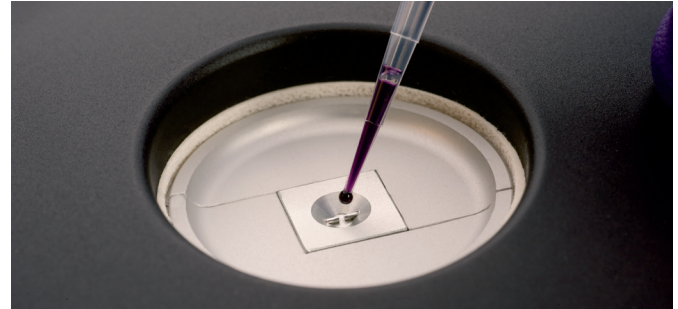
Micro-Volume Specifications of the BioDrop In-Built Sample Port

The in-built sample port uses no moving parts. This means that the instrument provides excellent reproducibility without the need to recondition or calibrate. Measurements are also highly accurate because the pathlength of the port is highly specified to \pm 5 \mu\text{m} . BioDrop also looks at the purity of your sample and flags up any issues you may need to address.